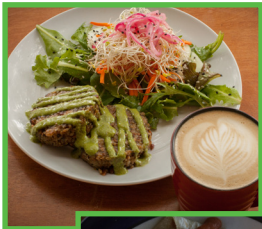
PUEBLO PLATE WITH RISOTTO CAKES GF