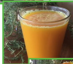
TURMERIC TONIC GF