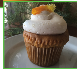
ORANGE CREAMSICLE CUPCAKE GF