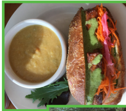
BAHN MI SANDWICH