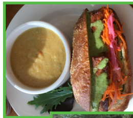
BAHN MI SANDWICH