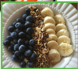
FRUIT YOGURT BREAKFAST BOWL GF